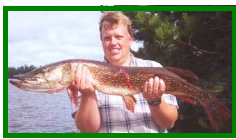
20 lb. Northern Pike caught by one of our guests