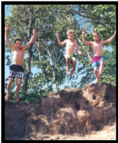
Kids will love Sandy Island (4-story island of sand a short boat ride away)

While on your stay, feel welcome to swim in our 175 feet of shoreline, jump on our Rave Sports™ water trampoline, take a ride down the water slide, use the 40-foot dock for great pan fishing, relax on the cedar deck overlooking the water and western sunset, or try the screened-in porch to escape from any bugs, build a camp fire, play horseshoes or golf, hike the trails behind the lodge, and fish and explore the 1600 acres of water with our paddle and fishing boats (included free with lodge rental). You'll love it here 😊