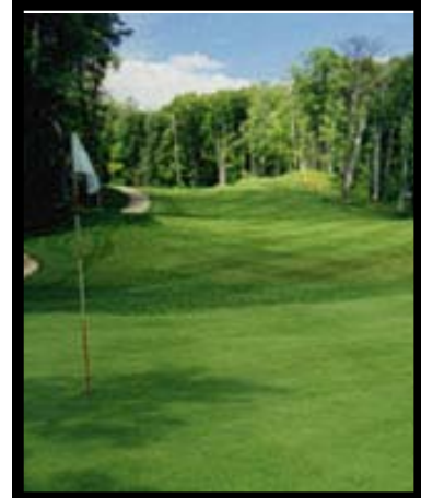
Northwoods golf at local Teal Wing is both beautiful & challenging